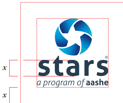
Clear space requirements

Never modify the size of the ® attached to the STARS Logo or STARS Seals